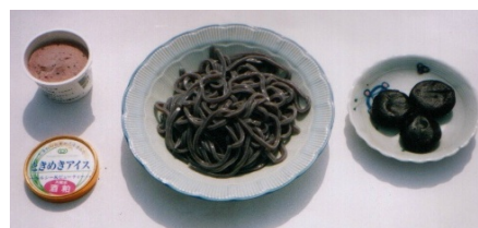
Fig.2 The ice cream, noodle and cakes using purple-black rice.