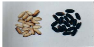
図2 紫黒米は高温条件で色素ができない（左）