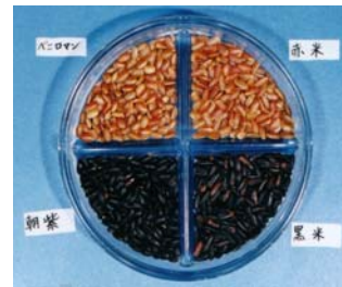
図1 赤米（タンニン系）と紫黒米（アントシアニン系）