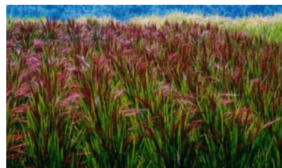
Fig.3 Beautiful blooming of a rice cultivar.