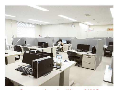
Computing facility of IMS

Program in Information and Management Systems (IMS) (Master Course)