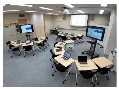
Seminar studio of IMS