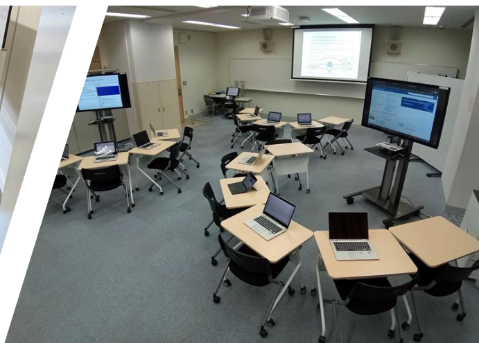
Seminar studio of IMS