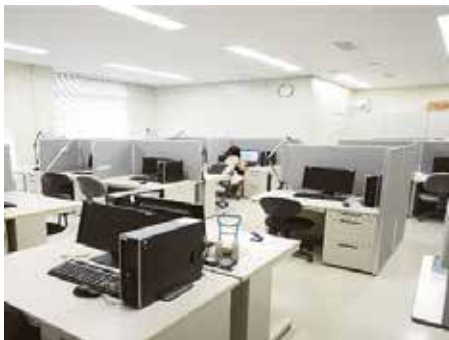
Computing facility of IMS

Program in Information and Management Systems (IMS) (Master Course)