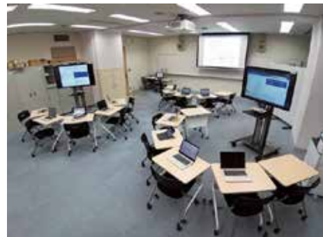
Seminar studio of IMS